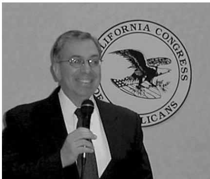
Senator Chuck Poochigian

Some scenes from the California Congress of Republicans convention, held in Fresno April 8, 9 and 10, 2005.